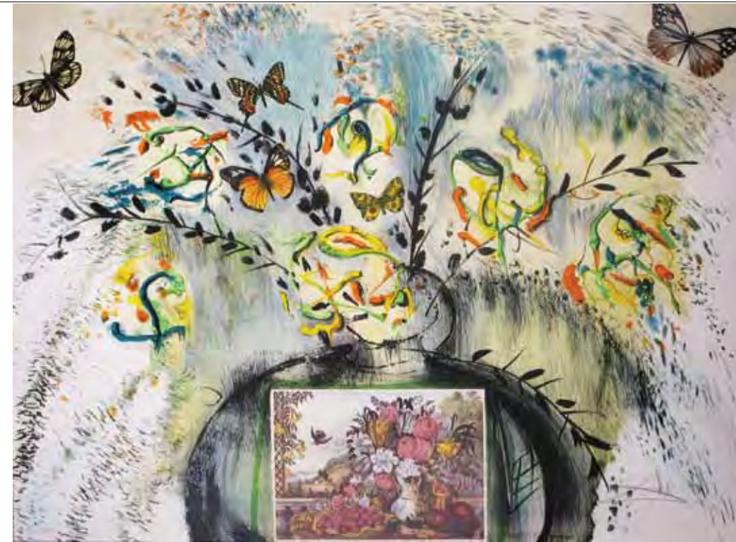
Salvador Dali, Flowers and Fruits , 1971, Lithograph, 29 x 37 1/2 inches

What draws so many to the gallery are the exclusiveness of the art holdings, culled from a collective know-how, recognition and reputation that DTR Modern has built within the art world.