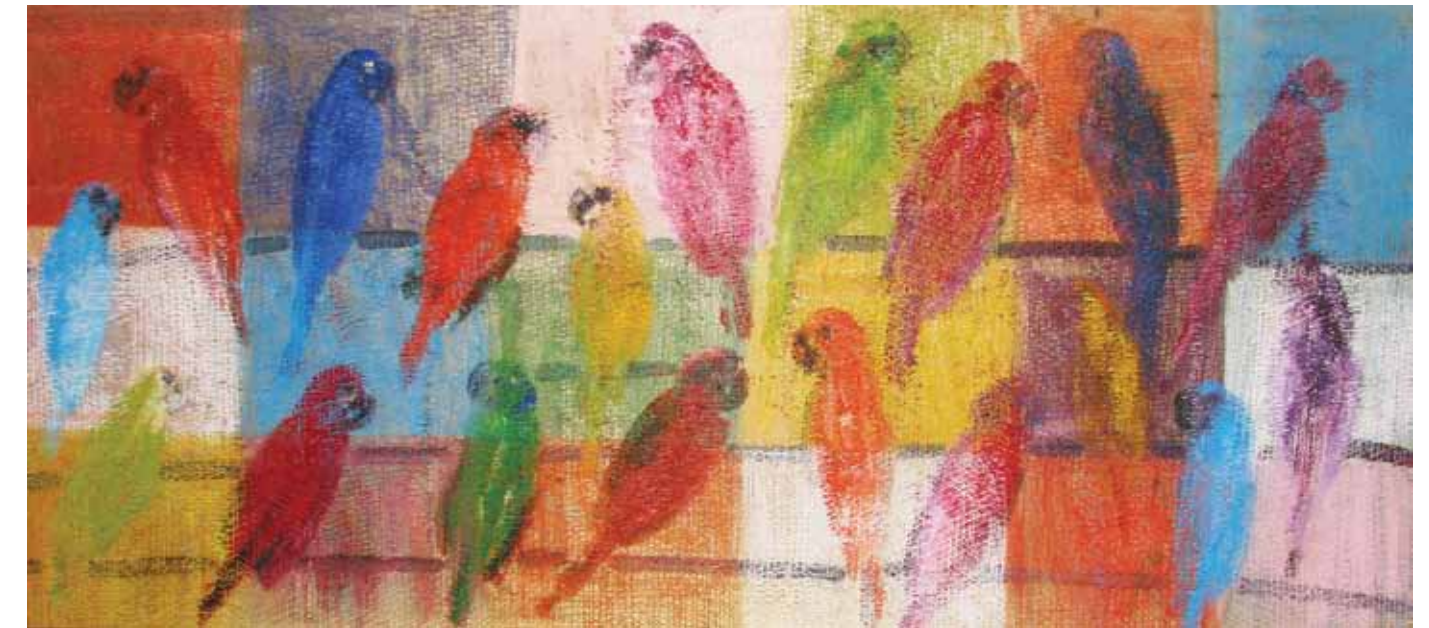
Hunt Slonem, Majabelle & Lucy Pointe Coupee , 2010, oil on canvas, 34 x 72 inches