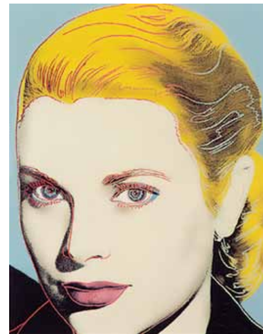
Andy Warhol, Grace Kelly (II.305) , 1984, screenprint on Lenox Museum board, 49.5 x 41.25 inches